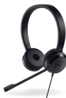
DELL PRO STEREO HEADSET | UC150

Enhance your all-day productivity with this wireless keyboard and mouse combo. Keeps your desk clutter-free and lets you stay productive with up to 36 months battery life and programmable shortcut buttons.