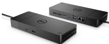
DELL DOCK | WD19S

Work at full speed with Dell's powerful USB-C dock. Charge your system faster, support up to three displays and connect to your peripherals via a single cable.