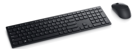
DELL PRO WIRELESS KEYBOARD AND MOUSE | KM5221W

A 23.8" monitor enhances your daily workflow. Featuring a height adjustable stand, Full HD resolution and integrated speakers in a space-saving design.