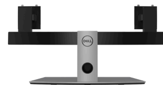
DELL DUAL MONITOR STAND | MDS19

Hear every word clearly on your next call with the Dell Pro Stereo Headset, optimized to provide in-person call quality.