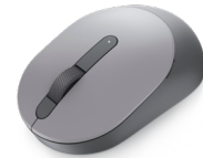
DELL MOBILE WIRELESS MOUSE | MS3320W

A dependable everyday companion providing eco-friendly quality protection and water-resistant protective coating for your device and other essentials.