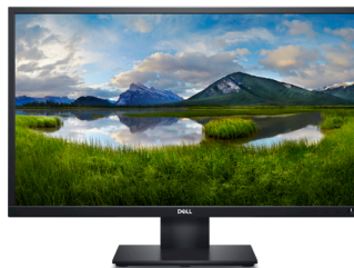
DELL 24 MONITOR | E2420HS

Work at full speed with Dell's powerful USB-C dock. Charge your system faster, support up to three displays and connect to your peripherals via a single cable.