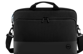
DELL PRO SLIM BRIEFCASE 15 | PO1520CS

With fast, high-power delivery of up to 65W/hr, this power bank can charge the widest range of USB-C® laptops and mobile devices.