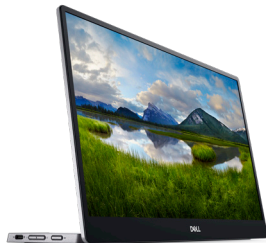
14" Portable Monitor - C1422H

Laptop docking station with a wireless charging stand for Qi-enabled smartphones or earbuds.