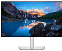
UltraSharp 40 Curved WUHD Monitor - U4021QW

Redefine productivity on this 40" curved ultrawide WUHD 5K2K monitor that delivers exceptional color and clarity.