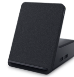
Dell Dual Charge Dock - HD22Q

Elevate your video conferencing experience on this powerful, intelligent 4K webcam 42 that optimizes your visuals with a large 4K Sony STARVIS™ CMOS sensor and AI Auto-Framing.