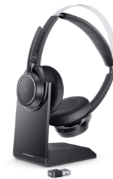
Premier Wireless ANC Headset - WL7022

Multi-task seamlessly across 3 devices with this premium full-size keyboard and sculpted mouse combo featuring programmable shortcuts and 36 months battery life. 43